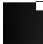
Blackened Stainless Steel [optional]